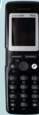
7502 DECT HANDSET

Cisco*, Broadsoft, Microsoft, Asterisk etc.