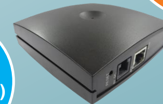
SINGLE-CELL IP-DECT 200 SERVER (6X12)