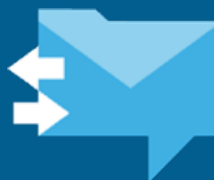
FILE BACKUP & COLLABORATION