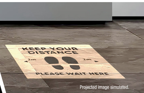
Laser Projectors for Digital Signage