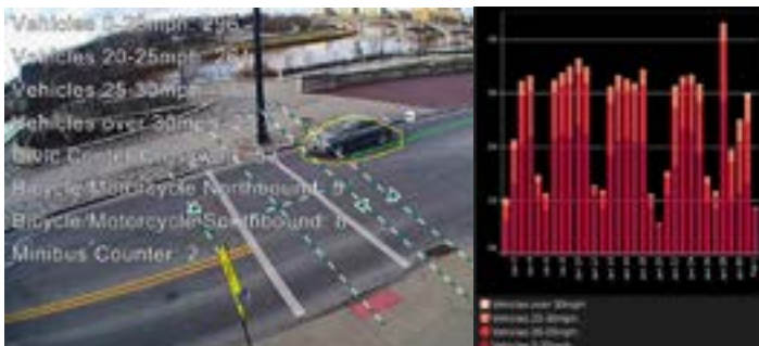
Programming cameras to track vehicle counts and speeds can provide meaningful data.

In busy cities, Video Analytics can also help monitor parking lot occupancy, curbside parking, and enforce no-parking zones. In lots, cameras can count open parking spots or track ingress and egress, and relay this data to the video management and parking management systems. Sharing this information and alternative parking locations on a dynamic message sign can help drivers find open parking faster and reduce traffic congestion and emissions.