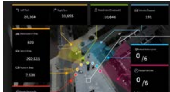
Bosch makes it easy to collect and filter data from multiple cameras to feed business intelligence dashboards.