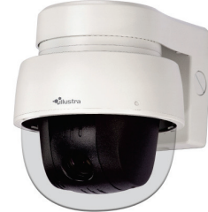
IPS02P6ANBTT ADCiPTZINDWCLR ADCiM6WALLWK

Available in black or white and can be used with a black or white bubble, cover with clear or smoked bubble cover