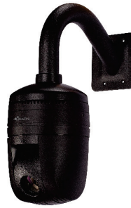
IPS02P6ANBTT ADCi6DPCAPOB ADCBMARM

Bubble available in clear or smoked with white or black trim ring