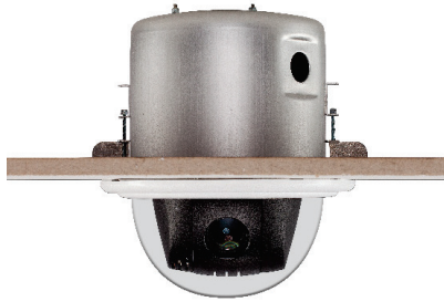
*Flush Mount with Bubble

Available in black or white and can be used with a black or white bubble, cover with clear or smoked bubble cover