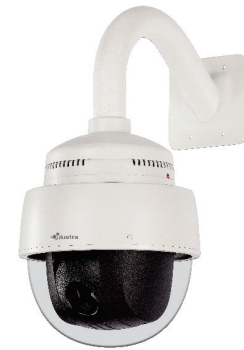
IPS02P6ANBTT ADCiPTZINDWCLR ADCi6DPCAPOW ADLOMARM

Available in black or white, and can be used with black or white bubble cover with clear or smoked bubble