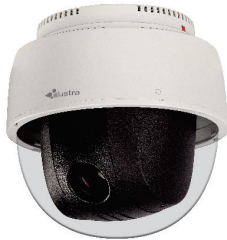
Bubble Cover IPS02P6ANBTT ADCiPTZINDWCLR

Available in black or white with clear or smoked bubble