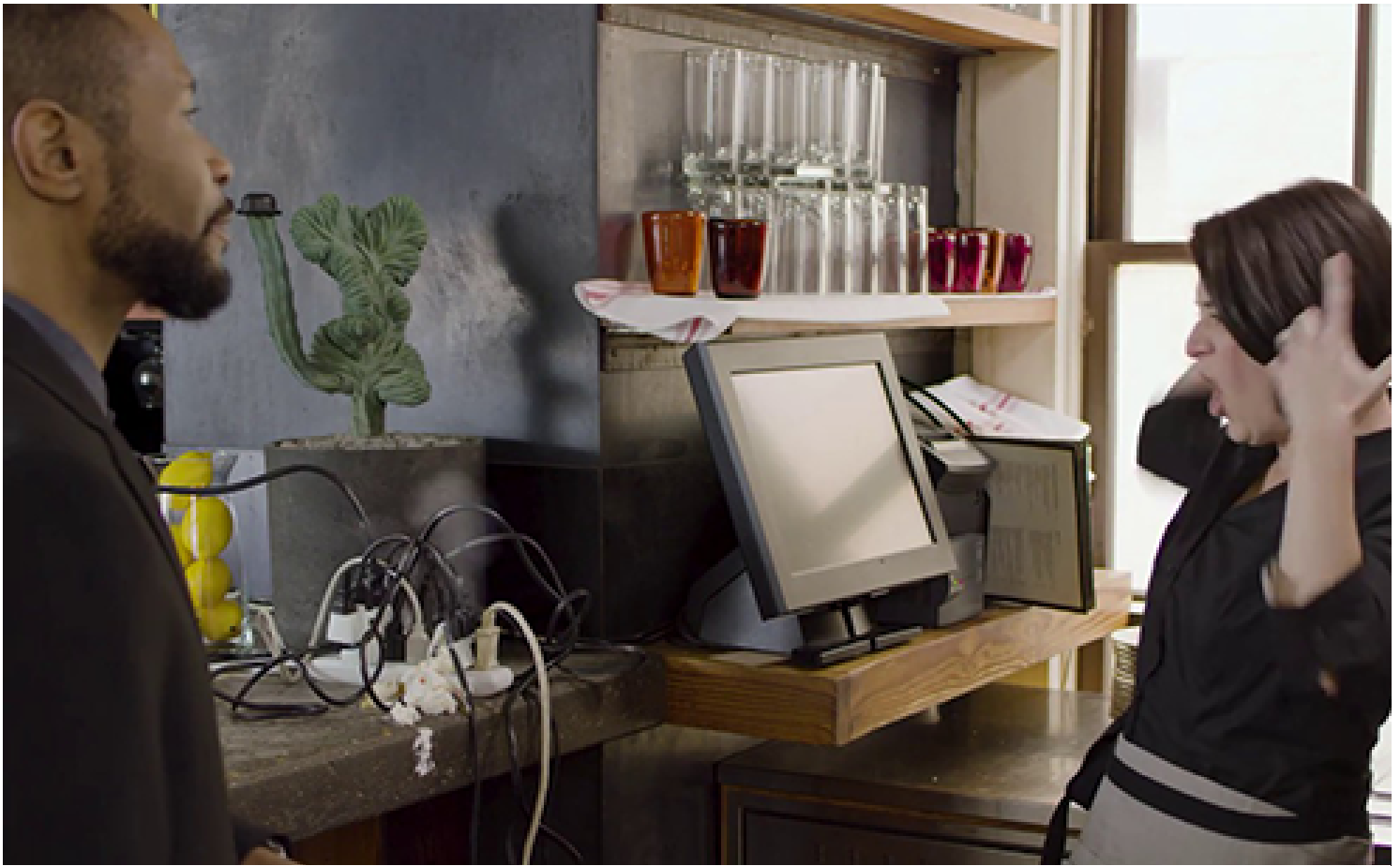
Warranties for switches (Video - 0:36 min).