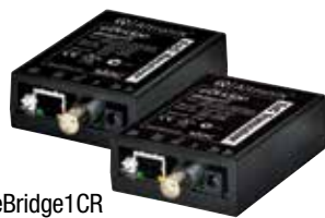
eBridge1CR and eBridge1CT