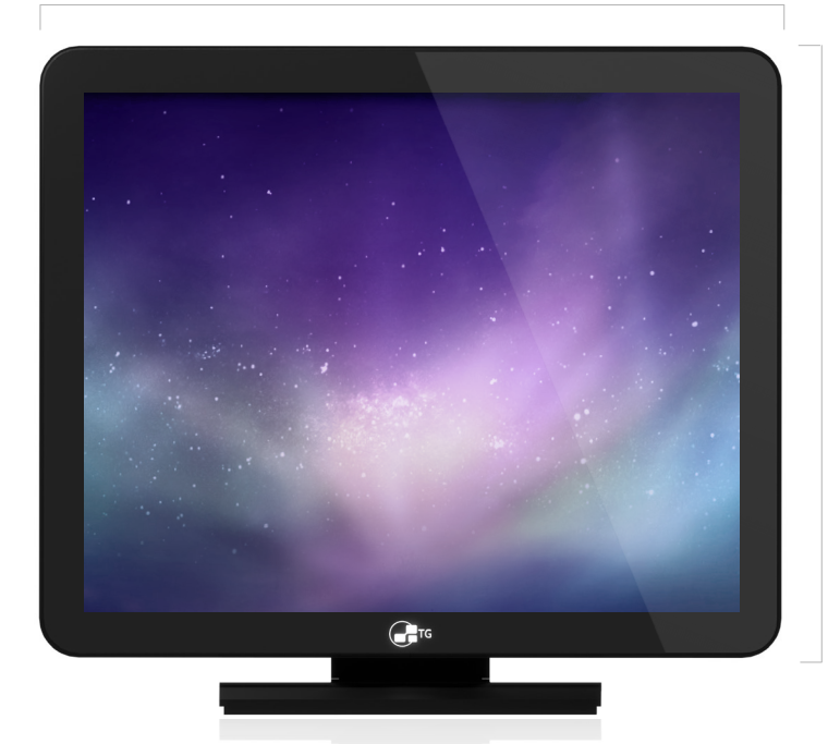
13.8 inches (351 mm)