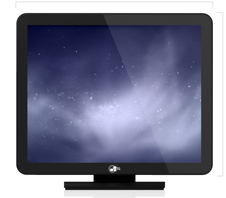
13.8 inches (351 mm)