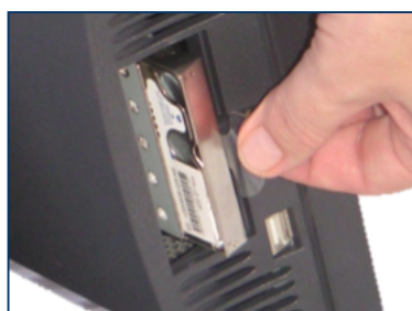
Quick Change HDD/SSD