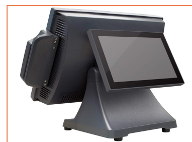
With MSR / iButton and 10.1 inch Customer Display