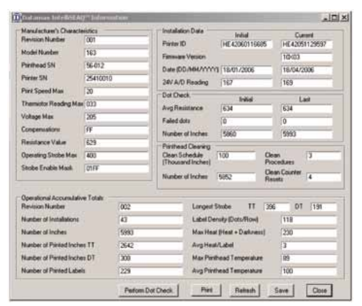
(Fig. B) Long Form