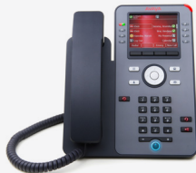
Avaya J Series IP Deskphones