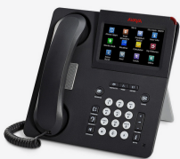
Avaya 9600 Series IP Deskphones