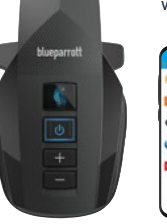
BlueParrott headset with App