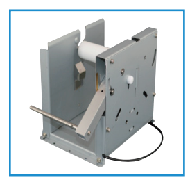
Large Paper Holder