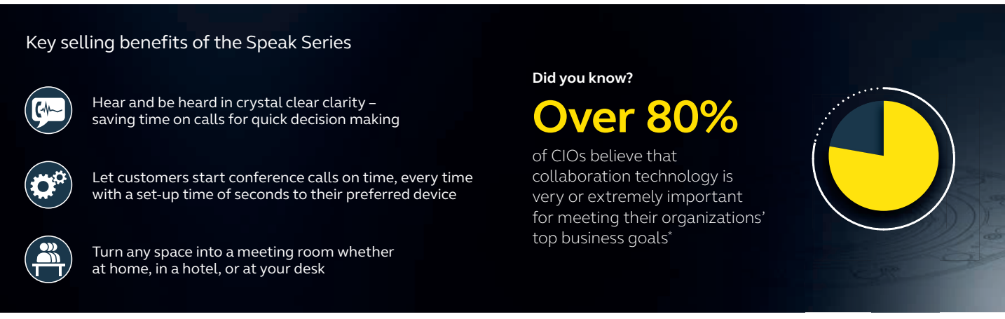
*Harvard Business Review Analytic Services, 2017