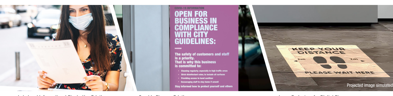
Label and Informational Single-Use Printing

Today's businesses are facing unprecedented challenges. Epson offers a wide-range of proven products that simplify addressing social distancing and customer safety-related messaging to help your business overcome these challenges. We have a variety of solutions that make it easy, from creating static signage and dynamic video communication for safety protocols, to printing disposable menus and personalized takeout labels.