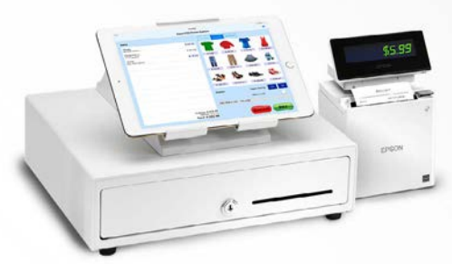
Peripherals not included.