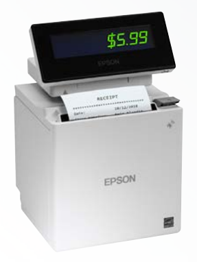
Peripheral not included.