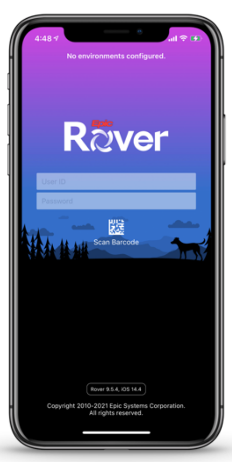
Figure 1: Log in screen for Epic Rover EHR

Our Software Development Kits (SDKs) make it easy to integrate world-class scanning and decoding into any business solution. From consumer-level mobile and web apps to vital custom Electronic Health Record (EHR) applications, these SDKs allow thousands of customers worldwide to incorporate the best-inclass scanning capabilities into their business solutions.