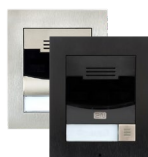
Compact with hidden HD camera

01301-001 nickel (surface mount) 01300-001 nickel (flush mount) 01302-001 black (surface mount) 01303-001 black (flush mount)