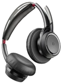
VOYAGER FOCUS UC $307.95