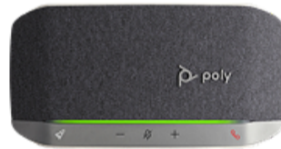
POLY SYNC 20 $129.95