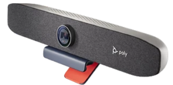
POLY STUDIO P15 $449.95

*As pain points and connectivity needs may be similar, there is some crossover in product recommendations between personas.