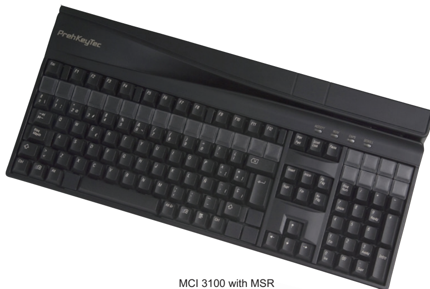
MCI 3100 with MSR