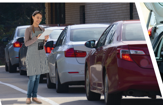
Print Receipts at Ordering Locations