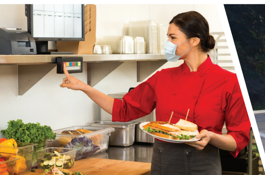
Route Orders Directly to Prepping Stations

Revolutionizing the way orders are received, identified and processed, Epson is helping customers streamline their drive-through and curbside pickup processes by offering a wide range of printing solutions aimed at providing receipt and label printing tools for both indoor and outdoor applications. Whether you're looking to expedite throughput or improve order identification accuracy while helping to eliminate errors and cut down on waste. Epson has a printing solution to better serve your business.