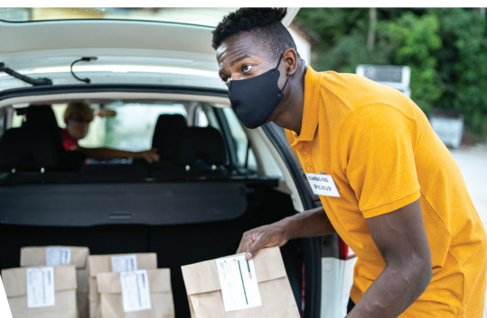
Personalized Labels to Improve Order Accuracy