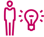
Enhanced Shopping Experiences