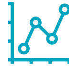
Network Health and Comparative Analytics