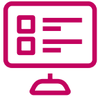
Retail-Centric Business Dashboards