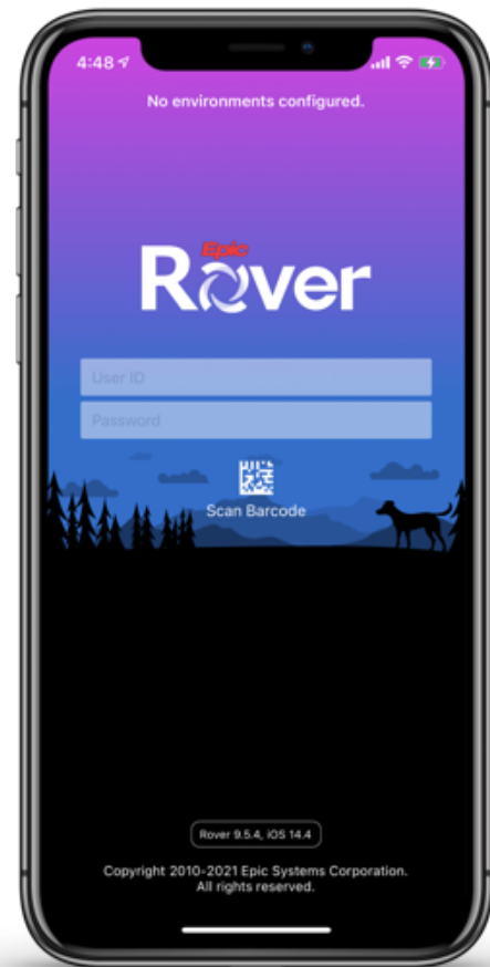
Figure 1: Log in screen for Epic Rover EHR

Online Licensing Also allows unlimited secure scans and decodes of 40+ types, and utilize additional features like accurate license management, device tracking, usage and performance analytics, and additional features on our roadmap.